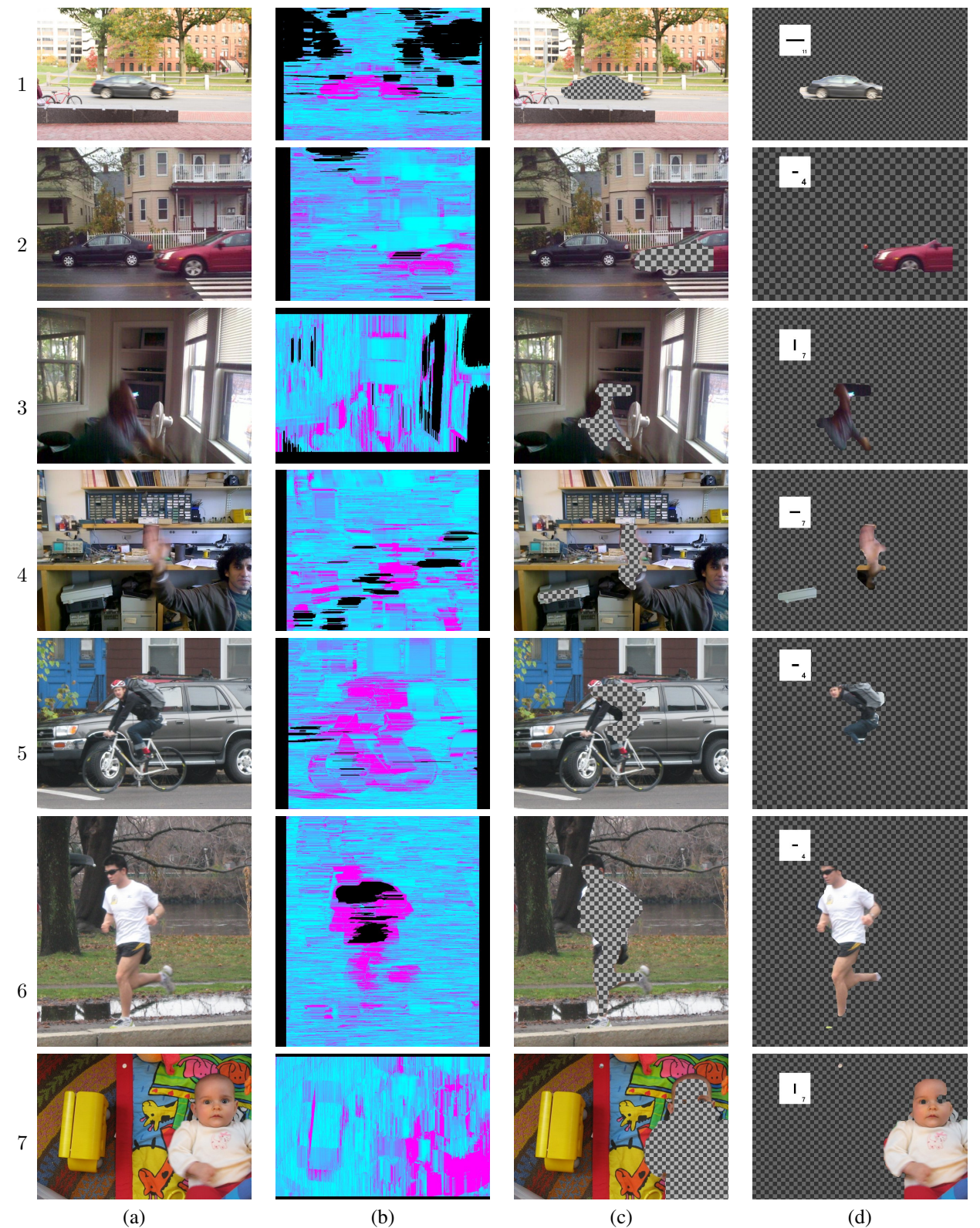
Figure 5. Results of motion blur estimation and segmentation on 7 images. (a) The input images. Image 1 was taken with a digital SLR, 2, 3 and 5 were taken with a cell phone camera, and 5, 6 and 7 were taken with a consumer point-shoot camera. (b) Relative probability maps of blur vs no-blur using the blur prior alone ( i.e. B_n ). (c,d) Segmentation results of the full algorithm, with (c) showing regions labeled as blurred along with the estimated blur kernel.