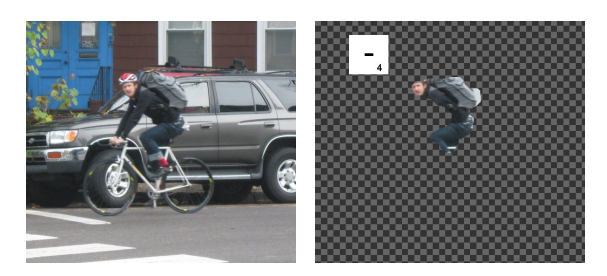
Figure 1. What's moving ? Given an image with motion blur, we seek to infer the blur kernel and the region it affects. The image on the right shows a segmentation of the blurred object in the image, and an estimate of the blur kernel generated by our algorithm.

The limited success with spatially-varying blur lies in stark contrast to recent advances with uniform blur. In the latter case, one can now reliably estimate and reverse the effects of blur through a variety of methods, even when the (spatially-uniform) kernel is of a complex, nonparametric form [4, 11, 12, 14, 17, 20]. The difference in the spatially-varying case is that blur must be inferred locally, using many fewer observations than are available in a large, uniformly-blurred image. And this means that one must use stronger image models to be able to extract the required information from a reduced set of measurements.