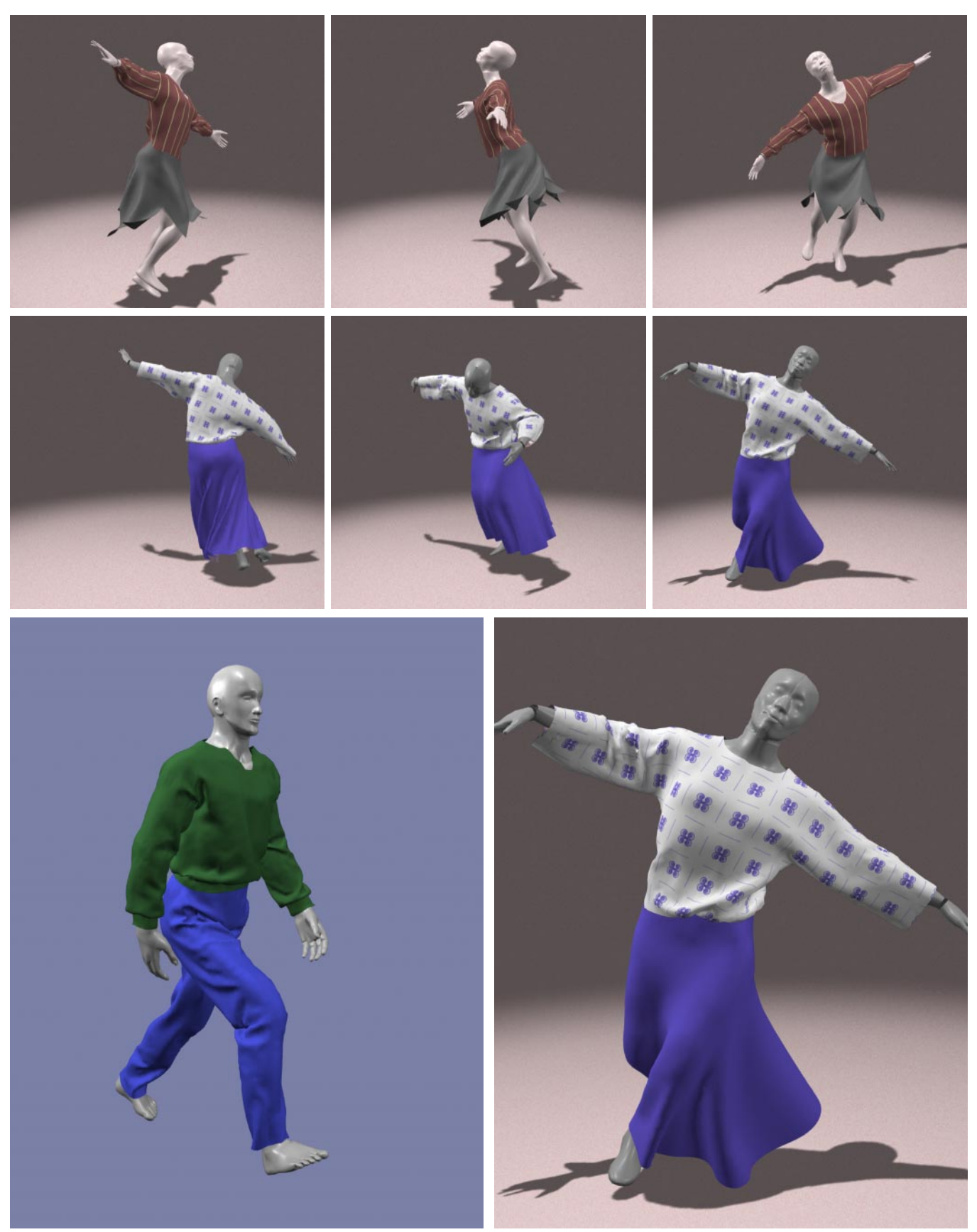
Figure 5 (top row): Dancer with short skirt; frames 110, 136 and 155. Figure 6 (middle row): Dancer with long skirt; frames 185, 215 and 236. Figure 7 (bottom row): Closeups from figures 4 and 6.