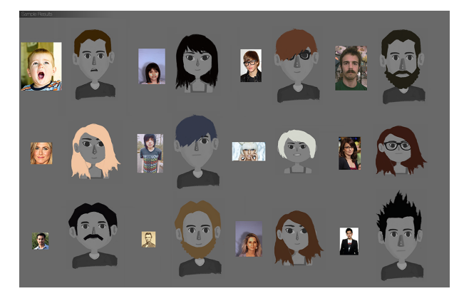
Figure 3: Sample results.