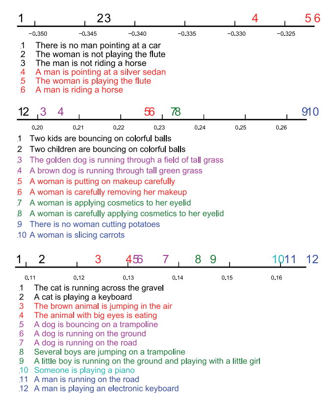
Figure 2: MaLSTM representations of test set sentences depicted along three different dimensions of h_T (indices 1, 2, and 6). Each number above the axis corresponds to a sentence representation and its location represents the value this particular hidden unit assigns to the sentence (shown below).

Next, we shift our attention from local characteristics of different hidden units toward the global geometry of the sentence representation space. Due to our training criterion, this space is naturally endowed with the \ell_1 metric and avoids being highly warped. While analysis of neural network representations typically requires nonlinear dimensionality re-