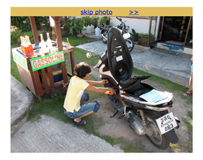
Back to Albums

Figure 3: Photo annotation HIT. For every ten photos annotated with speech, a photo-search HIT would appear. The relative position of elements was altered to save space.