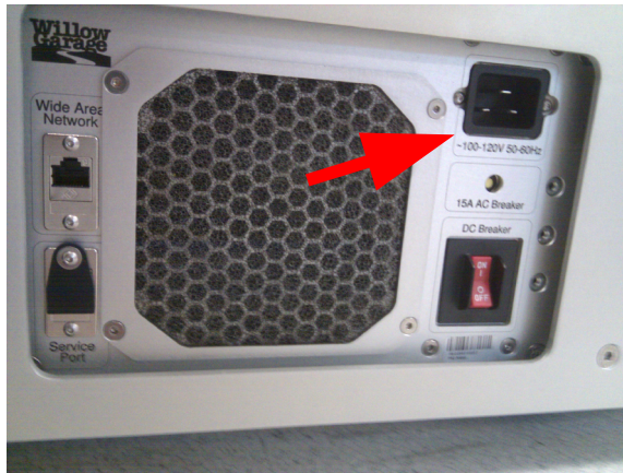
Figure 1: AC Inlet location on PR2 Rear Panel.

Plugging or un-plugging the PR2 Power Cord from the PR2 AC Inlet (see Figure 1) while the Power Cord is plugged into the Mains (AC wall outlet) could cause damage to the Power Cord and AC Inlet leading to overheating of the power cord and the AC Inlet.