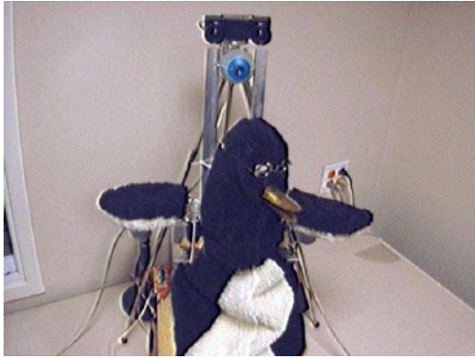
Figure 2: Mel, interactive robot used during our experiment.

we need to have a flexible visual recognition algorithm that can deal with multiple sources of information. In this paper, we use a simple cascade of discriminative classifiers to differentiate gestures and to learn contextual events. We show preliminary results indicating that even relatively impoverished dialog cues can have a significant impact on recognition performance. By observing the intra-sentence word position and whether the sentence was a question, we can significantly improve recognition over visual observation alone.