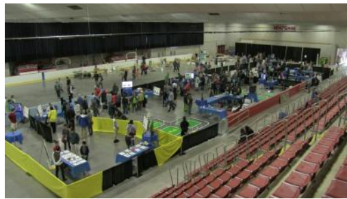
Fig. 6. Overview of the demo day Duckietown installation layout. Over one thousand duckies were taken by the public on that day.

The public walked a path through the installation being gradually introduced to increasing levels of abstraction, from the mechanical design of a Duckiebot to “parallel autonomy” [28] and intersection coordination of multiple robots. At each station students presented posters describing the underlying mechanisms, ensured the continuous and correct operation of their demonstrations and answered questions from the public, effectively disseminating their work. Mentors oversaw the students’ efforts to ensure smooth operations.