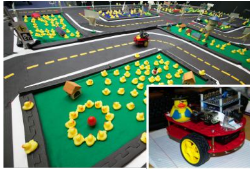
Fig. 1. Duckiebots are minimal autonomy platforms designed to operate in Duckietowns of arbitrary topology.

The Duckiebot is a minimal platform consisting of mostly off-the-shelf components. Computation is performed on-board on a Raspberry PI 2 (RPi2), strong of 4 900 MHz ARM cores and 1GB of RAM. Actuation is provided through two DC motor controlled wheels, included with the frame in the chassis kit. Wheel odometry is not used for estimation; therefore, the chassis is the most fungible part of the