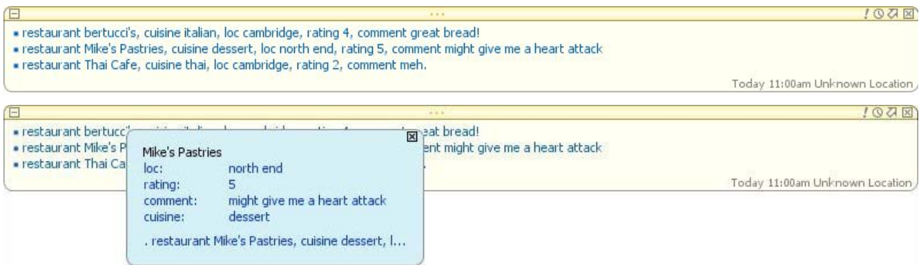
Figure 2. Through a right-click interaction, the user can gather together all information Jourknow knows about an entity.

The original incarnation of Jourknow focused on providing a lightweight text input mechanism for structured information entry and context capture for re-finding purposes, centered around a notebook-style design [12]. Based on the results of our study, our most recent efforts have redesigned the Jourknow client (Figure 1), iterated on the Pidgin input language, and added a mobile Jourknow client. Here we describe the new version of Pidgin as well as the mobile client.