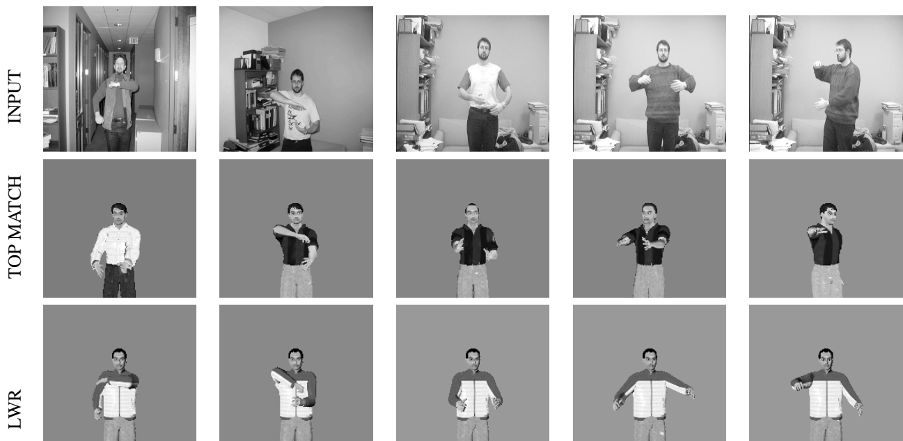
Figure 5. More examples, including typical “errors”. In the leftmost column, the gross error in the top match is corrected by LWR. The rightmost two columns show various degrees of error in estimation.