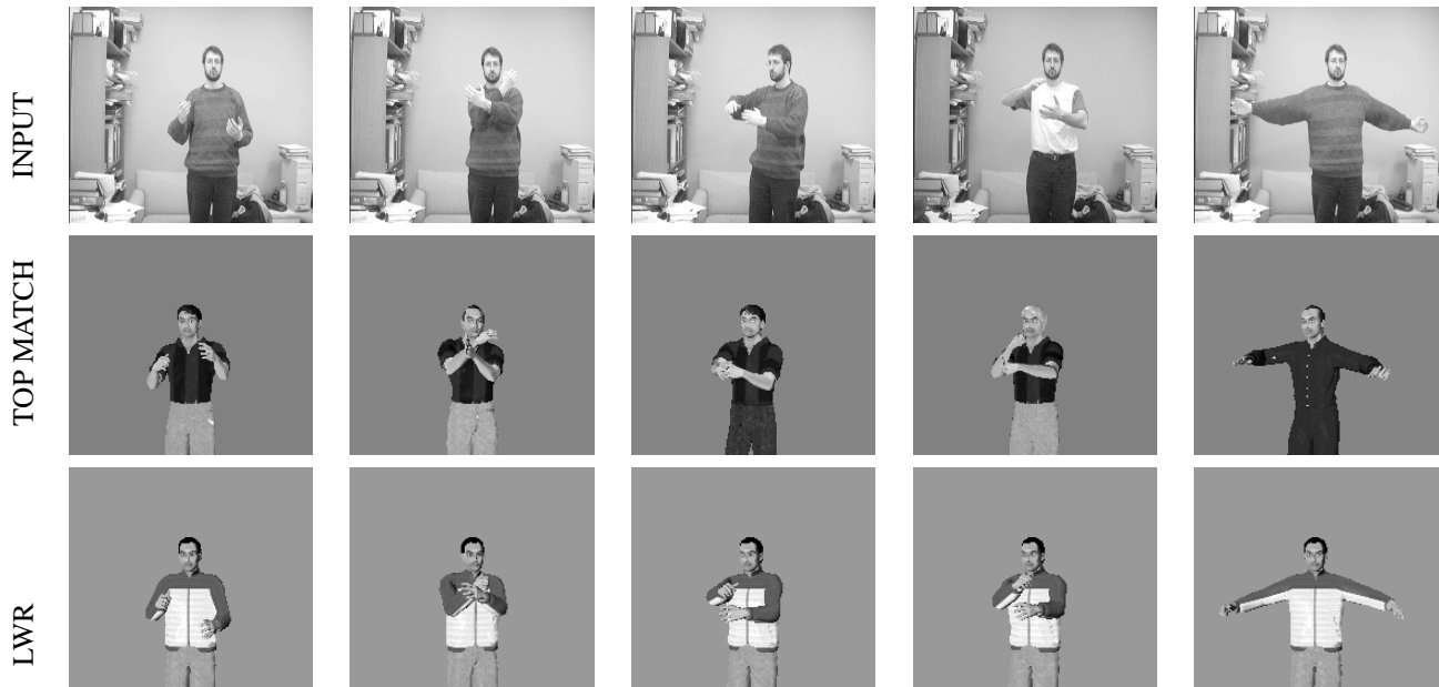
Figure 4. Examples of upper body pose estimation (Section 4). Top row: input images. Middle row: top PSH match. Bottom row: robust constant LWR estimate based on 12 NN. Note that the images in the bottom row are not in the training database - these are rendered only to illustrate the pose estimate obtained by LWR.