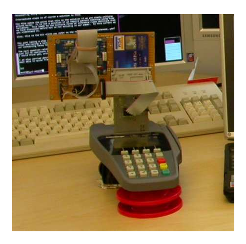
Fig. 1. Prototype POS skimmer

It can trivially capture and store account details and PINs for SDA cards in large quantities. Such devices exist for smartcard and POS development, but cost more like $2500 per device. A finished device could be slotted onto the terminal in seconds, and removed equally quickly should there be a problem. It is thus easier to deploy in environments with only limited collusion from the merchant, and more deniable than installing complex counterfeit terminal equipment or hidden cameras.