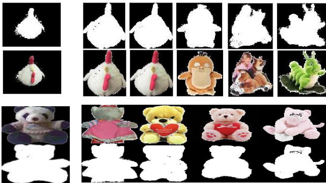
Figure 3: Example search results where the target object is present in (top, chicken) or absent from (bottom, bear) the database. Images were segmented with the interactive tool by our study participants.

Given a segmented image of the object of interest, that image is used to query the database of web images. Since we are focusing on segmented images, we are able to directly take advantage of the discriminative power of the object shape. We use the image matching technique presented in [4], since it is well-suited for comparing segmented shapes and allows efficient retrievals from large databases. Given an image search result with associated web pages, we could additionally extract salient keywords from those pages and use the resulting keywords to find more images to test against the search image, or to find relevant web pages directly [9].