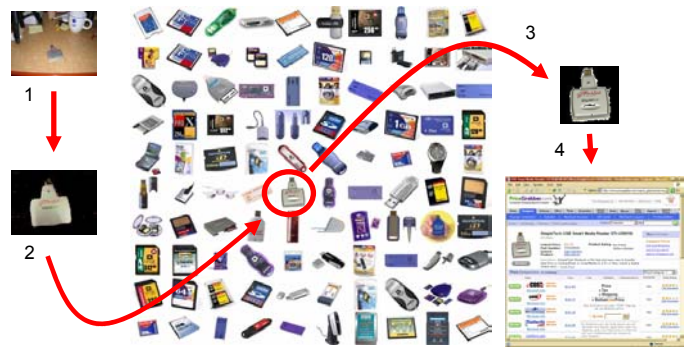
Figure 1: Mobile image-based object search. The result of a real search session for a flash memory reader is shown.

A variety of "smart" segmentation tools for interactive use have been developed, including a method for dynamic