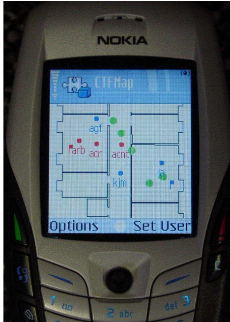
Figure 2: The game map displayed on a mobile device The six small initialled circles are the game players. The larger (green) blobs are mines that have been laid. The flags are both currently in their bases at either side of the map.

sults show that a single class 1 Bluetooth device could not reliably maintain a usable ACL 5 link when more than 20 metres to a class 2 device typically found in mobile phones. We could overcome this by using high powered antennas or managing handovers between multiple Bluetooth devices.