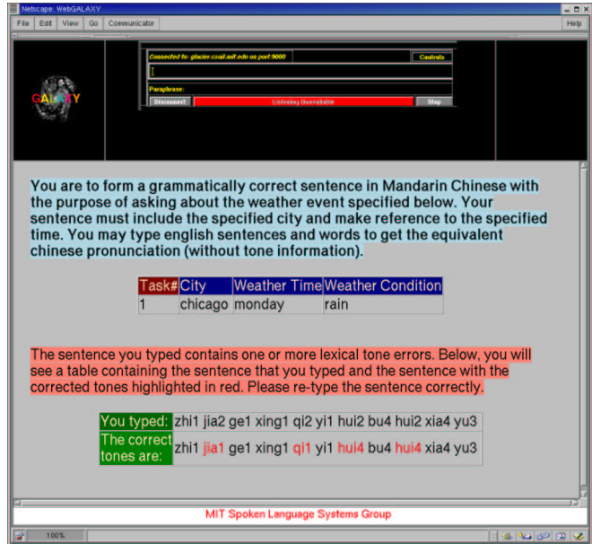
Fig. 2. Screen dump of Web-based drill exercise, in which the student must solve a weather scenario. The student is provided explicit feedback on any tone errors.

Prior to being able to converse with the system, a student would need to first prepare for a live conversation by studying the vocabulary and sentence constructs appropriate to the lesson’s topic. To make this study phase more engaging and more relevant, we have developed some on-line exercises designed to help them master the language usage within the scope of the lesson’s topic. Our exercises are centered initially on a native English speaker learning