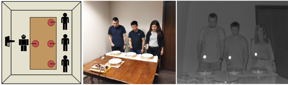
Fig. 2. Left: Experimental setup. A Kinect 2 tracks participant motion, as do piezoelectric sensors in the drums. The robot uses these sensor data to decide when to hit its drum. Center/Right: Three participants drum with the robot during a pilot study. RGB and IR images are shown.