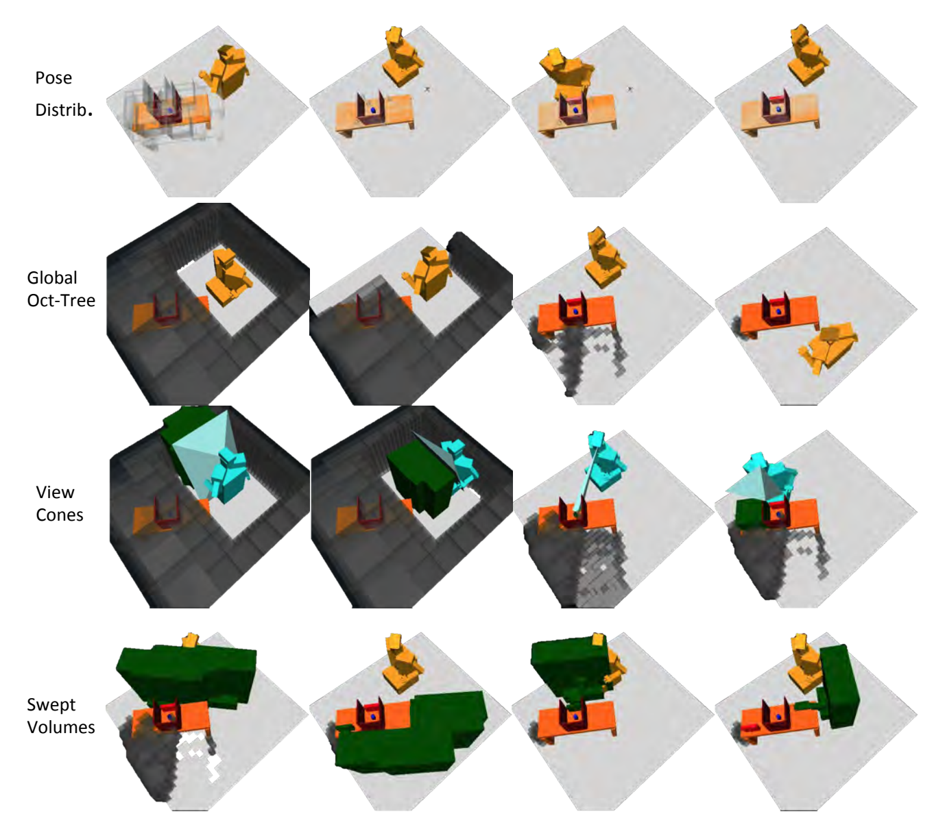
Fig. 1. The first row shows the distribution of the objects relative to the mean robot pose. The second row shows the unobserved space (as gray boxes). The third row shows generated robot poses (cyan), view cones (light blue) and target regions (green) for looking operations. The fourth row shows swept volumes for generated robot motions.

observed. In the third frame, a new object is discovered and added to the state of the filter; but it occluded the view of the cup, so it remains significantly uncertain. In the last frame the cup has been observed and its uncertainty reduced.