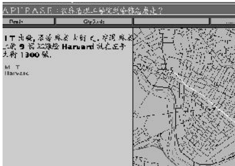
Figure 2: An example of a dialogue exchange between YINHE and a user. Subsequent to an inquiry about Harvard University, the user is asking for directions there from MIT. The system shows the path on the map and gives verbal directions, using discourse to infer Harvard as the referent for “there”.

speech data were collected using a simulated environment based on the existing English GALAXY system. Each subject talked to the system in Mandarin Chinese. A bilingual wizard then translated each spoken utterance from Chinese into an equivalent English sentence and typed it into the system. The system then processed the query and displayed the response back to the subject in Chinese. In this way, the subject feels that he/she is interacting with a complete Chinese system, and the conversation is like that in the real application. The data were used for training both acoustic and language models for recognition, and deriving and training a grammar for language understanding.