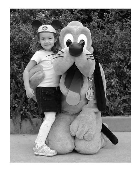
Fig. 3. Example photograph from the photo annotation system.

User annotations are automatically transcribed by a general purpose large vocabulary speech recognition system [7]. The current system utilizes a 38k word vocabulary. To compensate for potential misrecognitions, alternate hypotheses can be generated by the recognition system, either through an N-best list or a word lattice. The resulting recognition hypotheses are then indexed in a term database for future look-up by the retrieval process. In addition to the spoken annotation, metadata associated with the photograph is also stored in the database. This metadata can include various pieces of information such as the owner of the photograph, the date and time the photograph was taken, and the GPS location of the camera or digital device that took the photograph.