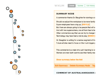
Figure 1: Wikum: a tool for summarizing long discussions.