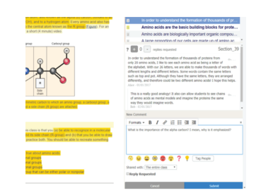
Figure 5: NB: adding emojis to comments to capture emotional reactions to textbook passages.

Figure 4: Pano: annotation of comments with moral framing.