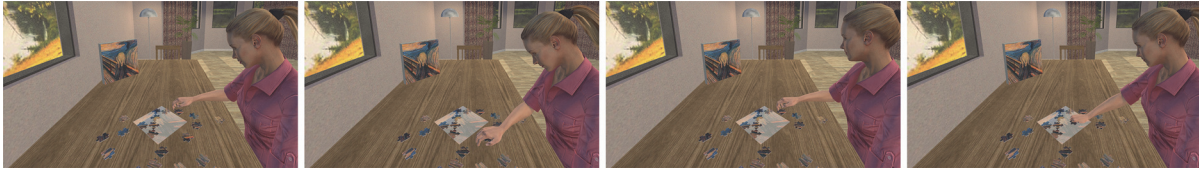
Fig. 4. The picking and placing activity of a puzzle piece was performed by our virtual character and controlled by our algorithm.

the virtual character has to make a wrong decision, our algorithm finds the wrong answer T from R . After the virtual character places V_c in any spot, V_N is set to NULL and S_N is set to PickUp . This function iterates until the participant or the virtual character places all the puzzle pieces in the right target spot.