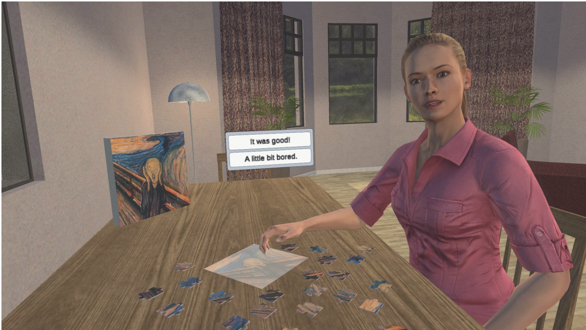
Fig. 3. An example graphical user interface of the small talk, showing the choices for an answer.

application solves the jigsaw puzzles based on a loop-based function called CHARACTERAI (see Algorithm A1 in Appendix A).