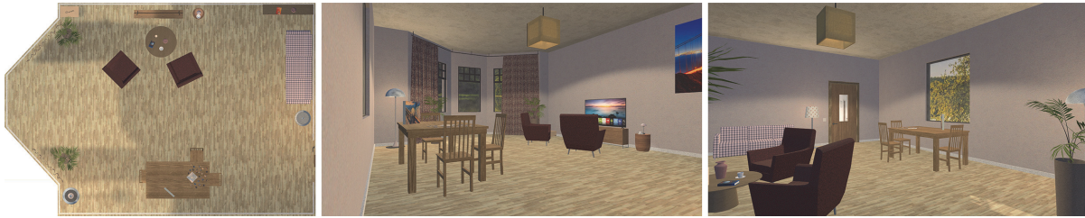
Fig. 2. We designed and used a living room virtual environment in our study: (left) top view, (middle) front view, and (right) back view.