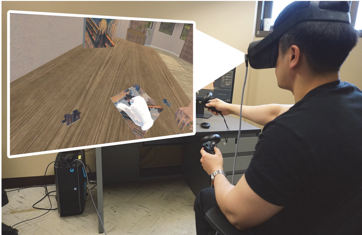
Fig. 5. A participant in our lab during the study.

The researchers provided a consent form for the participants to read and sign upon agreement. The Institutional Review Board of our university approved the consent form. The researchers then asked the participants to provide demographic data in the Qualtrics survey tool. Then, the researchers helped the participants put on the head-mounted display.