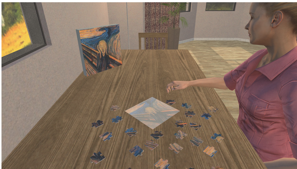
Fig. 1. First-person view of the main scene of our application. Our system placed the puzzle pieces randomly on the table. The jigsaw puzzle box is on the table's left corner. We used the semi-transparent puzzle board to inform our study participants where to place the puzzle pieces. We also see the virtual character that helped study participants to co-solve the jigsaw puzzle.

puzzle successfully since she always places the puzzle piece in the right spot, as in this condition, the probability of successfully placing a puzzle piece in the right spot is 100%.