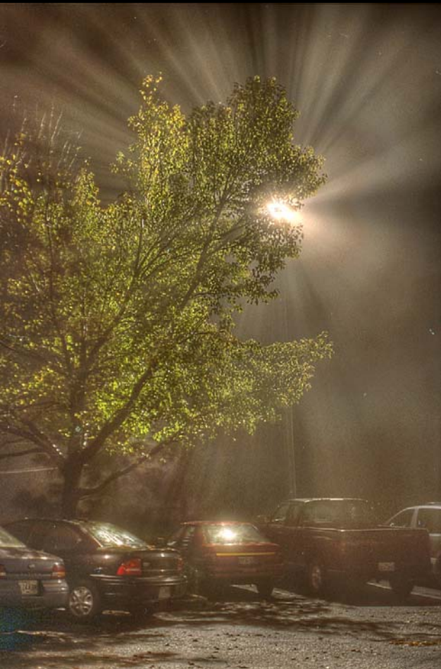
Gradient domain [Fattal et al.]