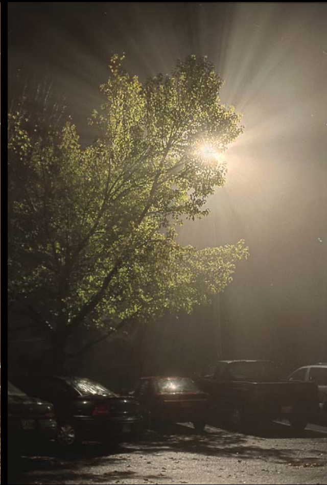
Photographic [Reinhard et al.]