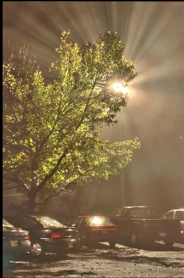
Bilateral [Durand et al.]