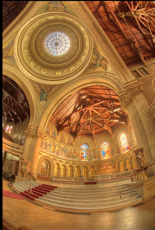
Gradient domain [Fattal et al.]