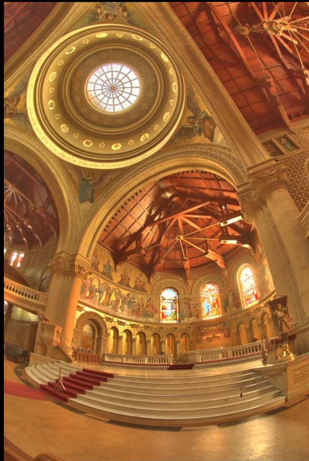
Bilateral [Durand et al.]