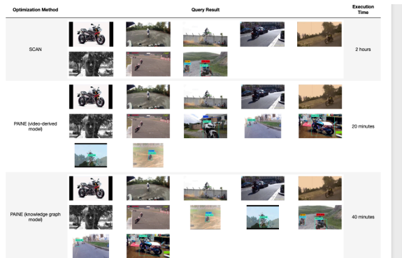
Figure 3: Summary table to compare SCAN, PAINE with the video-derived model, and PAINE with the knowledge graph model for the motorcycle selection query