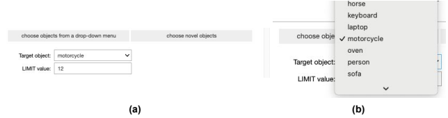
Figure 2: User Interface of PAINE

In this section, we demonstrate a prototype system of PAINE on YouTube videos in diverse domains. They comprise a typical and important workload — other applications as listed in Section 1 may also use YouTube-style videos.