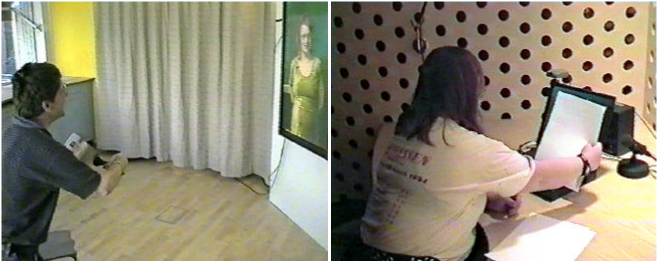
Figure 4. To the left: A male user of 45 years with CP-injury shows the content of a saucepan to the remote communication partner. To the right: a 25 years old female with Down's syndrome tries to show the text that she has written on the paper to the remote communication partner by putting the paper in front of the image. (She did not understand that the remote person saw her through the video camera attached at the upper left corner of the portable PC.)

workPLACE, described above. The study took place in the apartment comHOME located at Telia Networks in Farsta, Stockholm, Sweden. The tests were conducted during three days in June 1999.