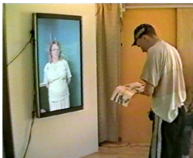
Figure 5. Left: a male user of 45 years with CP-injury tries to use sign language on the desk-top video set-up but it shows up to be almost impossible due to the small image and low resolution. Right: a 21 years old male with MDB/DAMP reads out loud the content of a directions for use folder at the videoTORSO.