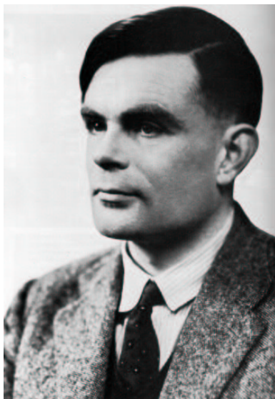
Figure 4.1: Alan Turing

Turing's paper is all the more remarkable because he wrote it in 1936, a full decade before any electronic computer actually existed.