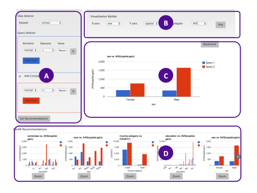
Figure 1: SEEDB Frontend: (A) query builder, (B): visualization builder, (C): visualization pane, (D) recommendations pane

a visualization to be interesting if it displays a large deviation from a reference. For example, a visualization of sales of staplers over time may be interesting if a reference (e.g., sales of all products) is showing an opposite trend. Our user study comparing SEEDB with and without recommendations demonstrates that users are 3X more likely to find recommended visualizations use ful as compared to manually generated visualizations.