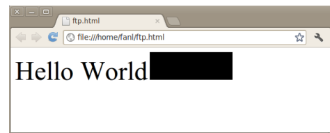
Figure 3. Chromium-19.0.1031.0 screen shot after continued execution with RCV. The screen shot for the subsequent version with a developer-supplied patch that corrects the error is identical.

Although Chromium has a multi-process architecture that renders each web page in a separate process (thereby minimizing the effect of errors), to avoid performance problems associated with having many open processes [1], Chromium limits the number of rendering processes to 20. Given tab usage patterns in modern browsers [11], the chances of collateral damage caused by an error in a separate tab are high. Despite Chromium’s multi-process architecture, this particular null-dereference error occurs in Chromium’s main process. The entire application terminates and the user loses any unsaved data, including data in unrelated windows or Chromium tabs.