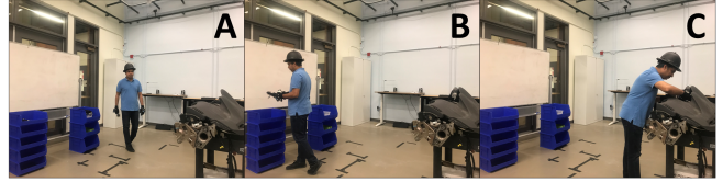
Fig. 1: Three activities similar to the activities from the Auto-DA dataset: A) moving to the dashboard, B) collecting the speedometer unit, C) placing the speedometer unit onto the dashboard.

Researchers across many fields have attempted to address this concern, which is defined as the online activity