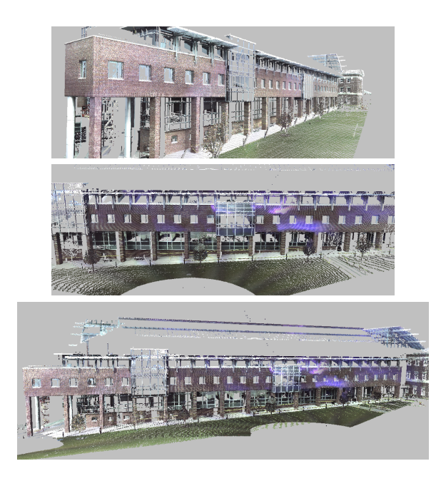
Figure 5. Two scans (top and center) for which range keypoint matching succeeded (bottom), but intensity keypoint matching failed. Range keypoints succeeded despite the highly-repetitive structure of the building since only one correct match was needed.

verified transformations for each of the 15 pairs, and we use these as "ground-truth" for testing. We added another 15 pairs of scans that do not overlap to form an initial test suite of 30 scan pairs.