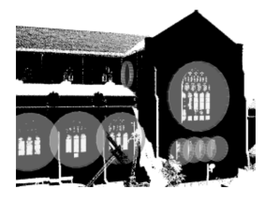
Figure 2. Automatically detected range keypoints, i.e. holes in planar surfaces where spin images are computed. Black pixels represent points on planar surfaces. In this example all significant holes are found. The circles represent the area over which the spin images are computed.

inverse of an estimate of the local sampling density, similar to [7]. Spin images are matched by computing the cosine of the angle between the vectors formed by each spin image histogram, giving a similarity measure in the interval [0,1].