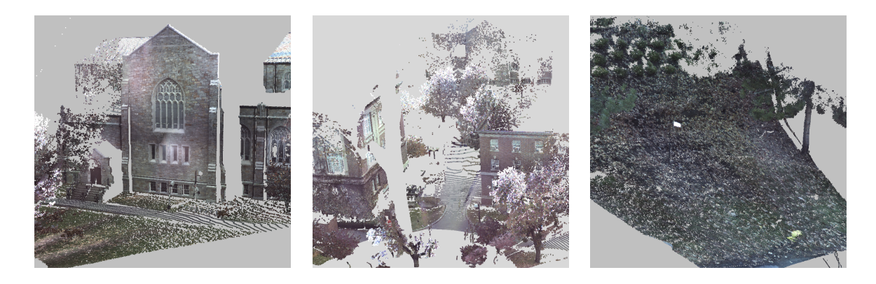
Figure 1. Three example range scans taken on the Rennsselaer campus illustrating some of the challenges of the location recognition problem, including occlusions, viewpoint variations, and different types of structures varying from buildings to trees and hillsides (right). The left and center pair has an extremely small overlap region, with the farthest-away building at the top of the center scan being the main building in the left scan.

one based primarily on intensity images. Range keypoints summarize local 3d structure at distinctive locations in the range scan, while intensity keypoints summarize local intensity structure at distinctive locations in the intensity data. These therefore offer independent, almost complementary, approaches to matching and hypothesis generation.